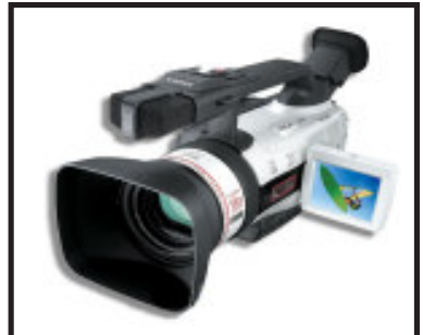
The new lightweight GL-2 cameras are a welcome addition to the portable equipment options.

Hope is high that we will be making great pictures in early 2007.