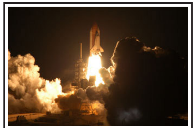
Town residents were able to watch the spectacular NASA Space Missions Atlantis and Discovery, from take off to landing, LIVE in their entirety on Channel 12.

"...The most perfect day - not only of the course, but also of my teaching career - was the day the class taped the Veterans' History Project at the studio on April 15, 2003, ironically, the first day of the War in Iraq. It was a multi-generation experience of mutual learning among students, veterans, their spouses, and the staff of the Foxboro Senior Center and FCA. The stories that were videotaped are kept for refereence here in town, but also in the U. S. Library of Congress. It will be an outstanding memory for me always."