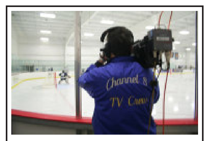
Nice to see the FCA crew ID jackets around the sports venues in town.

In December 2006 a new character generator graphics system was purchased for Control Room A and will be installed early in 2007. This new character generator (CG) will be identical to the system now in use within the Mobile Unit. More importantly this upgrade will allow FCA to meet technical requirements in other areas as well. The CG that is being replaced in Control Room A will not be thrown away, but rather moved to the School Committee console where the CG functionality fits better with the system requirements. Whenever possible we make an effort to keep equipment identical in our different facilities so that once a volunteer learns one system they can use it throughout our operations. Other technical benefits include the ability to have redundant systems that can backup each other in the event of a failure and easily transfer files between systems.