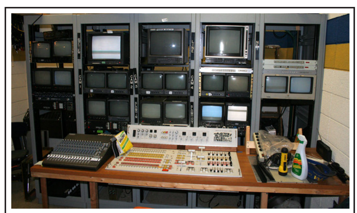
Nine -count'em, NINE ... preview camera monitors, with a possible expansion to ten, mounted in a five bay rack unit along with audio, graphics and a three tiered Grass Valley switcher, nearing final installation at the Foxborough High School auditorium "Beck Studio", freshly paintly, complete with Blue & Gold racing stripe.

Despite the numerous weekend marathon sessions over the past year or more, there still remains some tedious tasks to be done before the system can be tested. Each of the nine, plus spare, camera cable runs, along with its intercom and audio, is pulled through the ceiling of the auditorium to its place under the switcher in the small accessory room which has been transformed into a nerve center of teleproduction The room has been cleaned and painted in preparation of the donated equipment which Paul Beck has obtained for our use. According to reliable sources, we are 80% of the way to our first concert coverage without dragging 100 ft. cables through the auditorium.